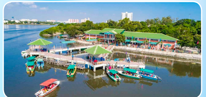
Ammaar Yacoob XII - B

4. Muttukadu Lake: Want a quick weekend getaway that's close enough to Chennai but far from the bustling traffic? Pack your bags, because you're going to the Muttukadu situated on the East Coast Road en route to Pondicherry. The Muttukadu Lake involves the popular boat trips that everyone loves. One can do rowing, windsurfing, water skiing, Aqua scooters and explore all other water sports. There are beautiful bamboo boathouses and a floating boat jetty too!